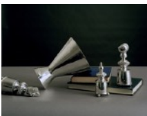
Stilled (2009) Chromogenic print 60x 80 cm framed 1/5 £ 5000