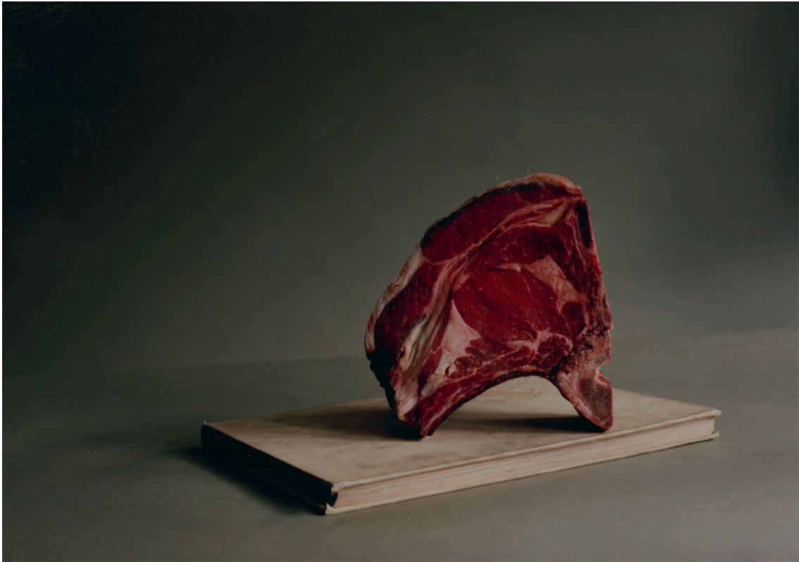
A Modest Proposal (2016) Chromogenic print Framed 65cm x 82 cm 1/5