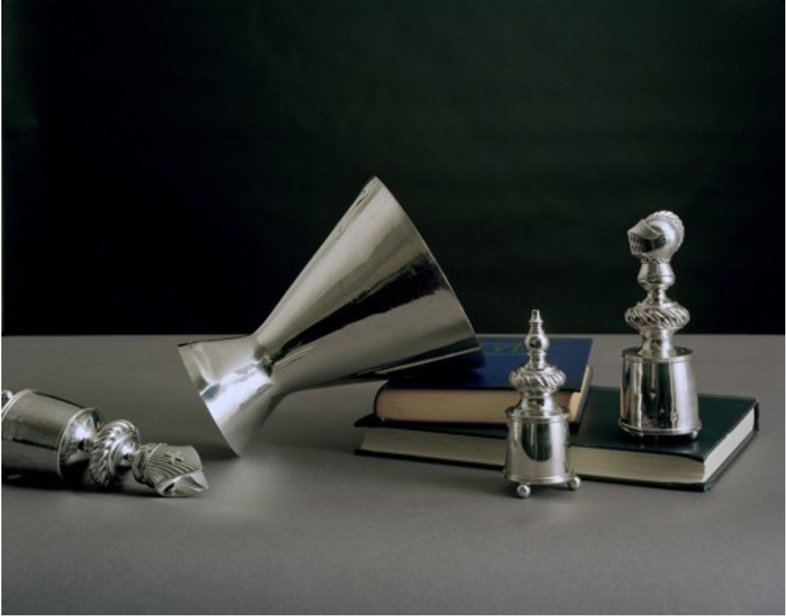
Stilled (2009) Chromogenic print 60x 80 cm framed 1/5