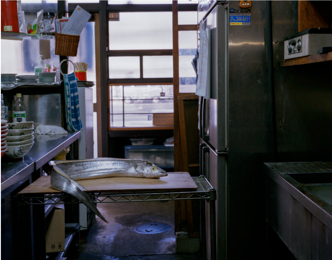
Kyoto Kitchen (2016) Chromogenic print 40 x 50 cm 1/5