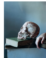
Special Edition Chromogenic print Editions 25 £ 250