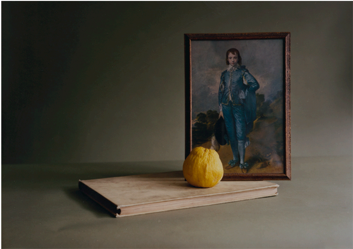
A Frame of Mind (2016) chromogenic print framed 65cm x 82 cm 1/5