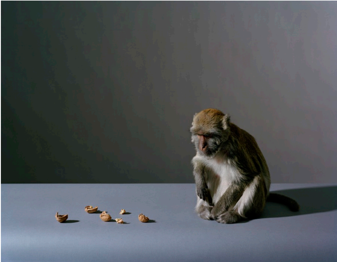
Portrait of a Monkey with Walnuts (2009)