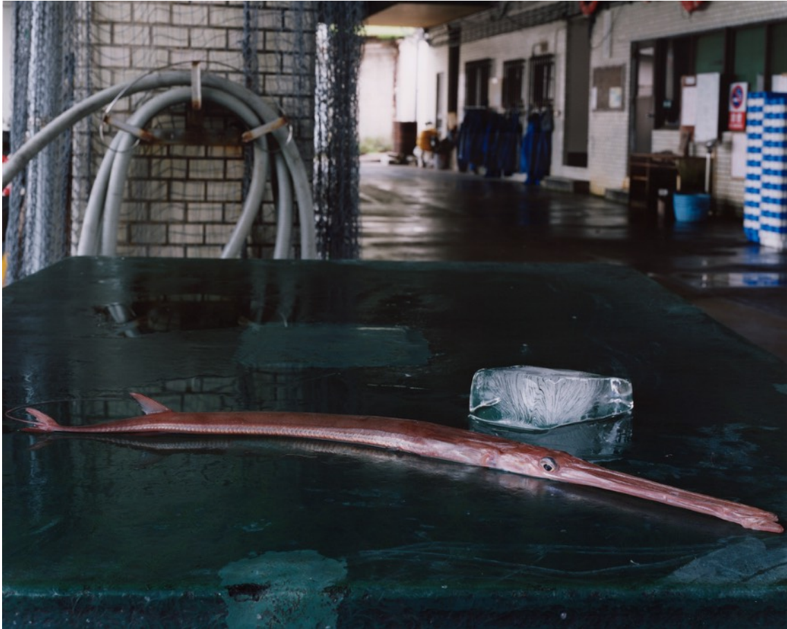
Aka Yagara (2016), Kyoto Ine Chromogenic print 40 x 50 cm 1/5