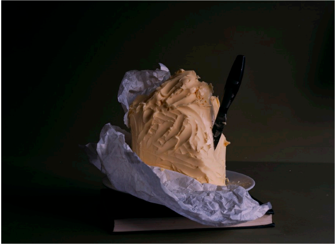
Mound of Butter (2016) Chromogenic print Framed 65cm x 82 cm 3/5