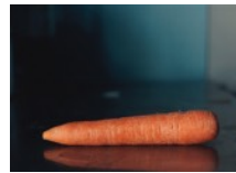
A Real Allegory with Carrot (2001) Chromogenic print 50 x 60 cm framed 4/5 £ 4000