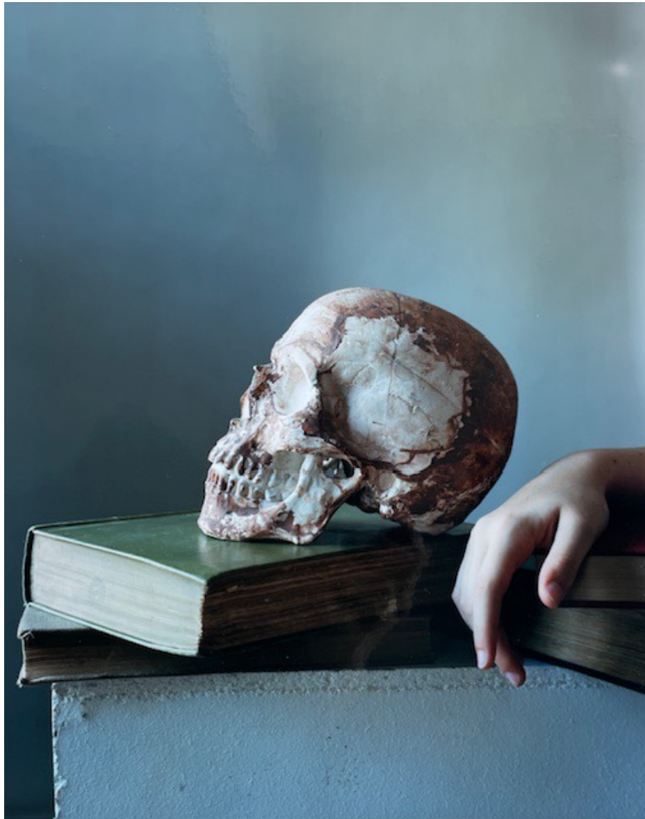
Untitled Chromogenic print Exhibition Special Edition 25 x 19.7 cm image size 40.5 x 50 cm paper size ED. 25