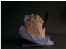
Mound of Butter (2016) Chromogenic print Framed 65cm x 82 cm 3/5 £ 5000