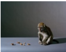
Portrait of a Monkey with Walnuts (2009) Chromogenic print Framed 100 x 120 cm 3/5 £ 10.000