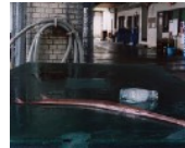
Aka Yagara (2016) Chromogenic print 40 x 50 cm 1/5 £ 2500