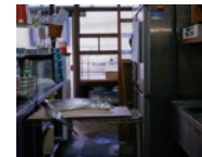
Kyoto Kitchen (2016) Chromogenic print 40 x 50 cm 1/5 £ 2500